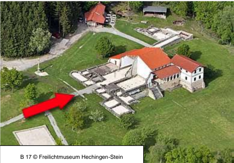
B 17